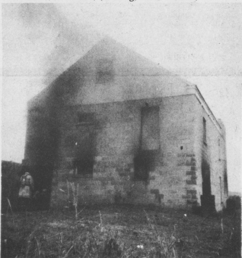
Two firemen entering smoke filled house for practical work