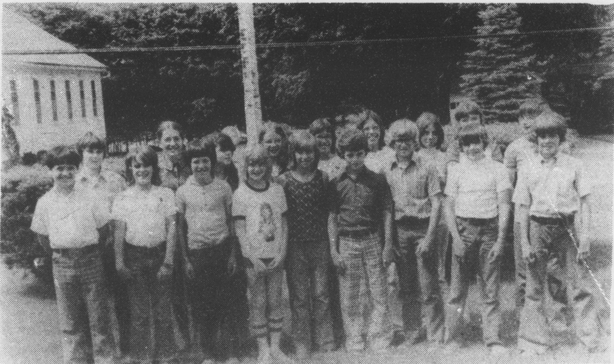
Winners of Physical Fitness awards

Music will be sponsored by the Donegal Gospel Four.