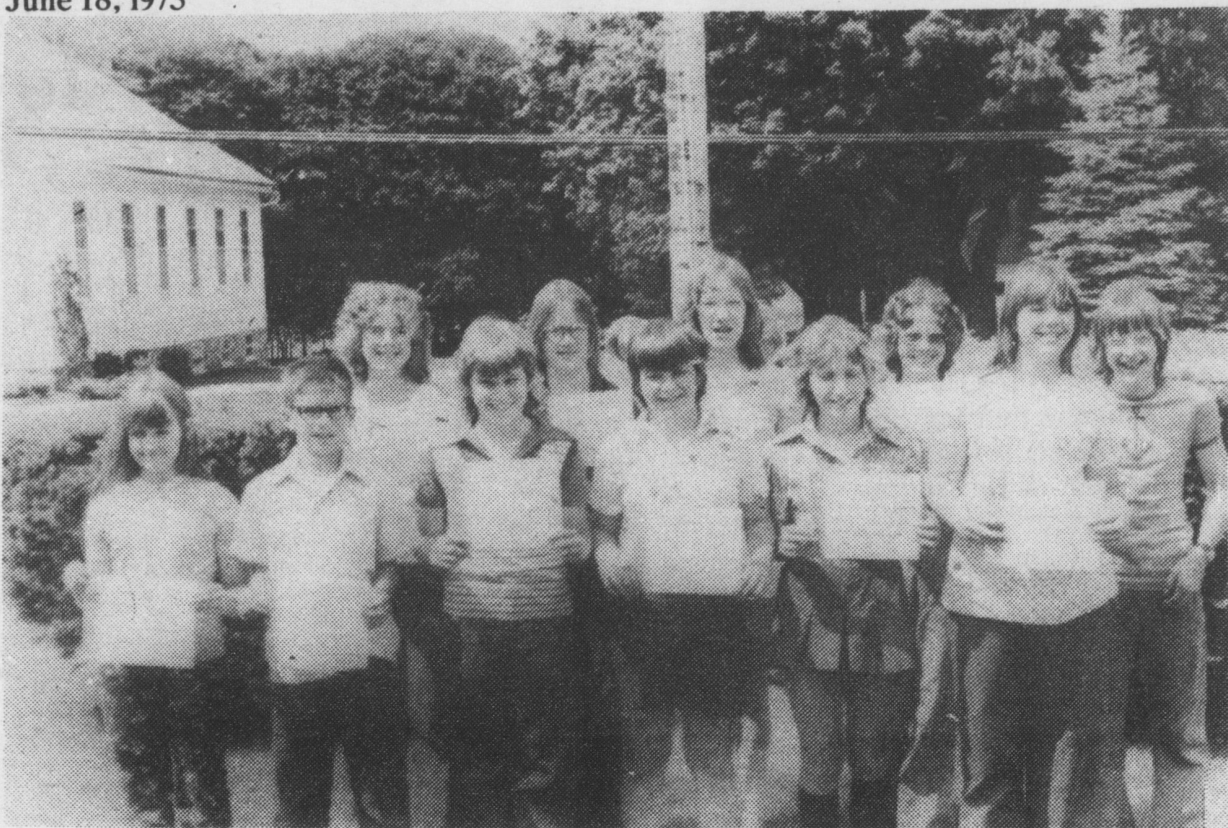
Winners of Safety Awards