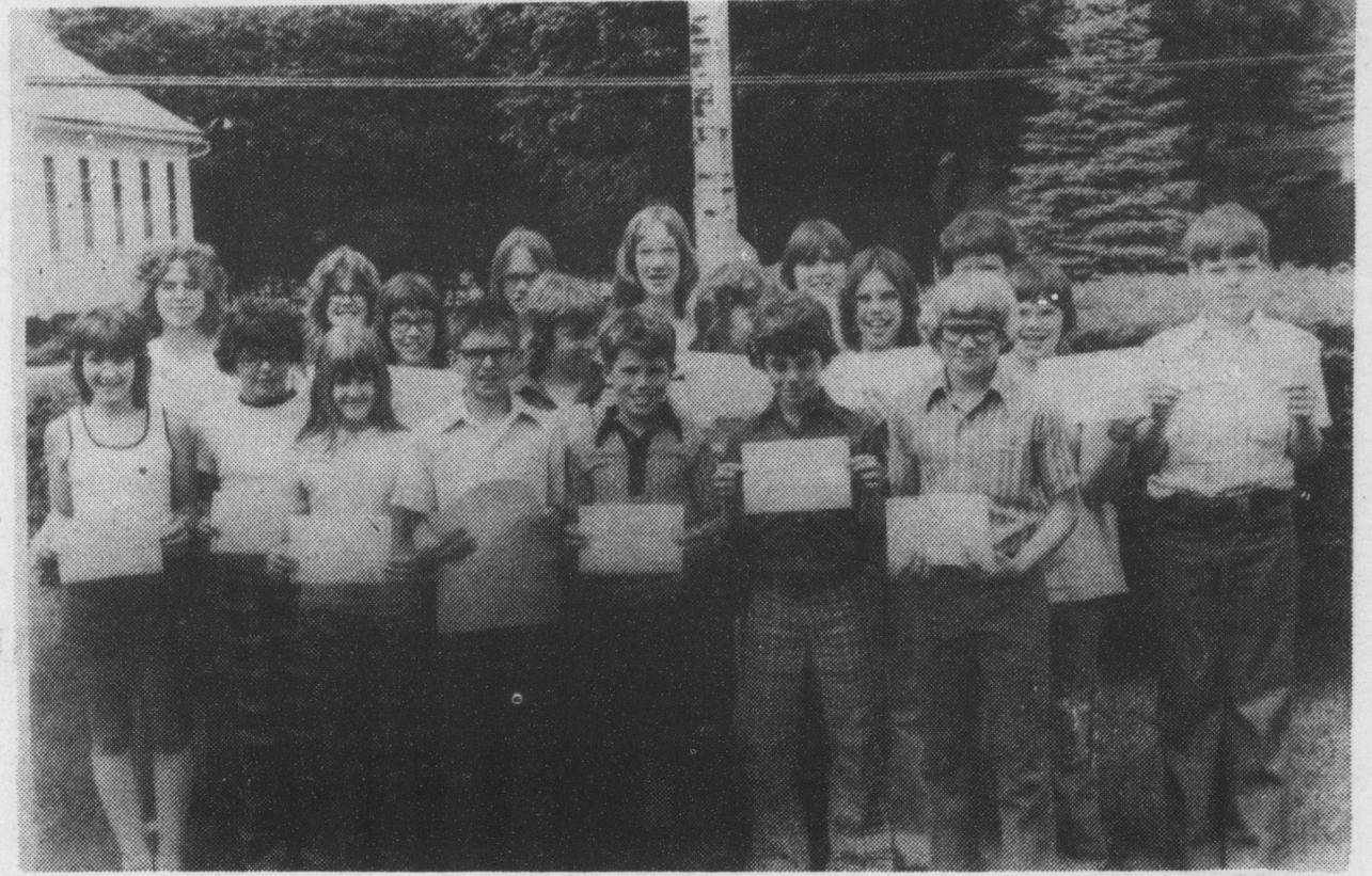
Winners of Vocal Awards