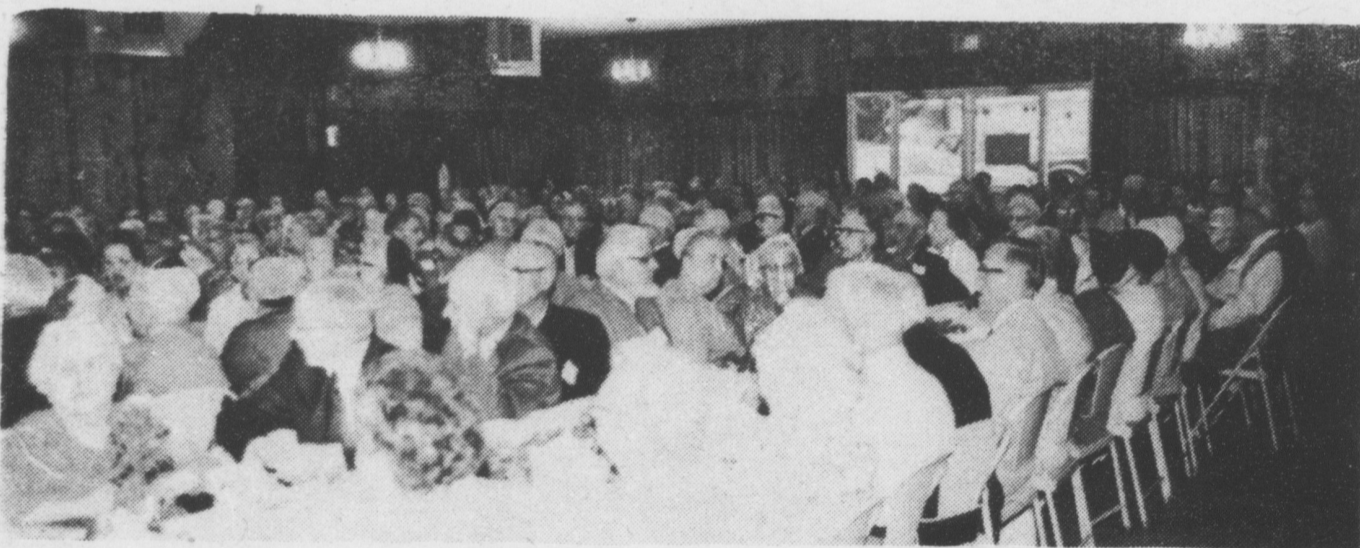
A view of some of the guests at the 75+ Banquet