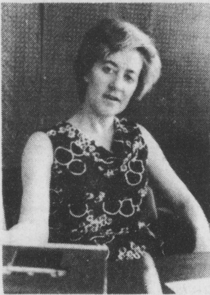
'Each one of us has a purpose.'