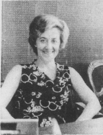
'...a whole new world for me.'