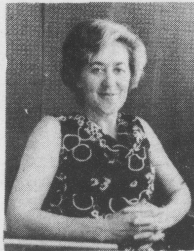
'Life is so full of surprises... Opportunities come along.'

"Each one of us has a purpose. When we are willing to accept that, there is no end to the possibilities."