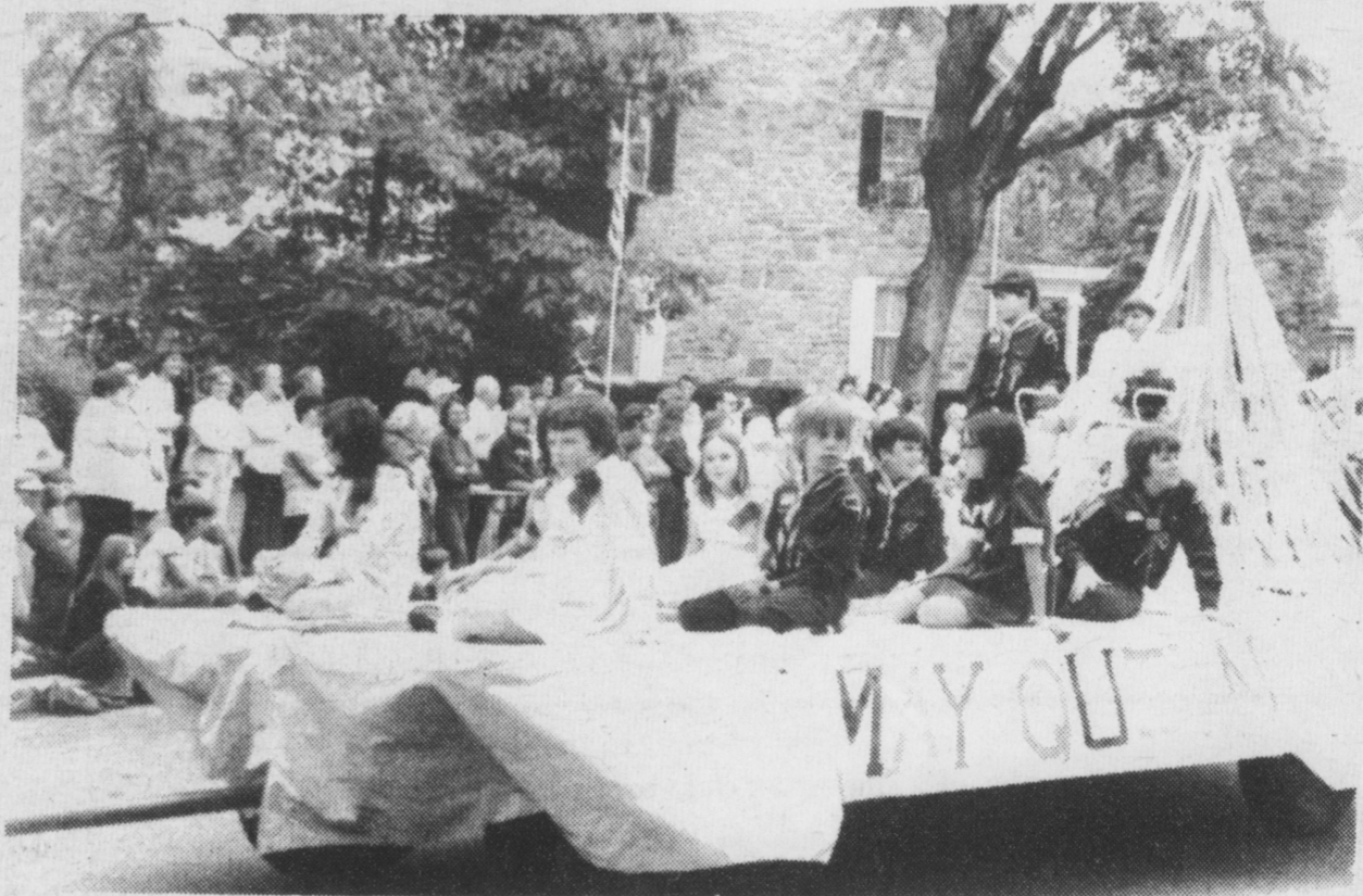
The queen and her court