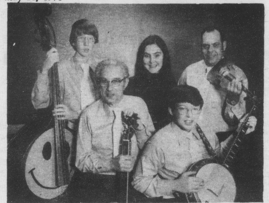
The Adams Brothers