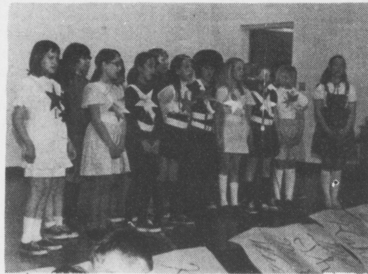
Cast of "Smokey Wins a Star"

An Arbor Day ceremony at Grandview Elementary School last week included a play about fire safety in the woods called "Smokey (Bear) Wins a Star," and the planting of trees in honor of retired teachers. The program was the