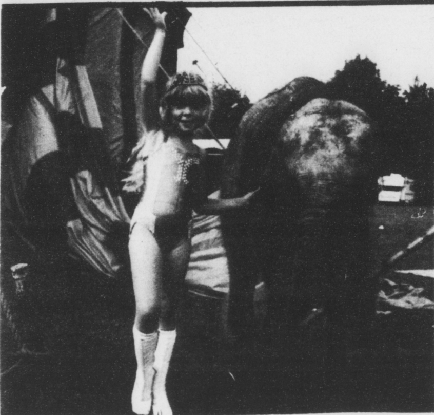
"I'M FOR WOMEN'S LIB!"