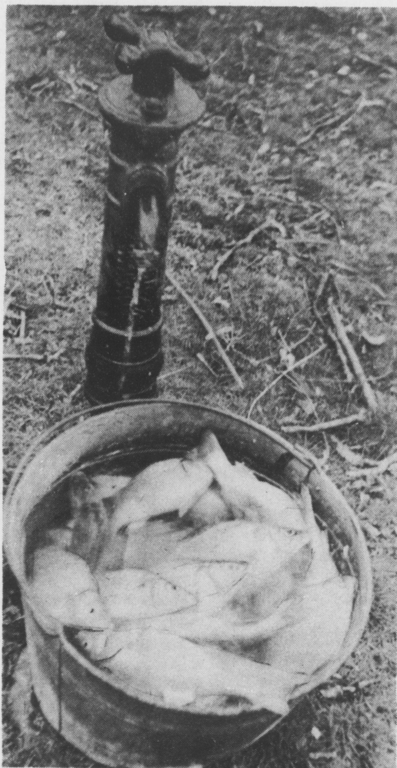
A fine kettle of fish in a Marietta backyard

The Royal Wild West Circus will be here one day only, May 7 at Kunkle Field in Mount Joy, with performances at 4 and 8 p.m.