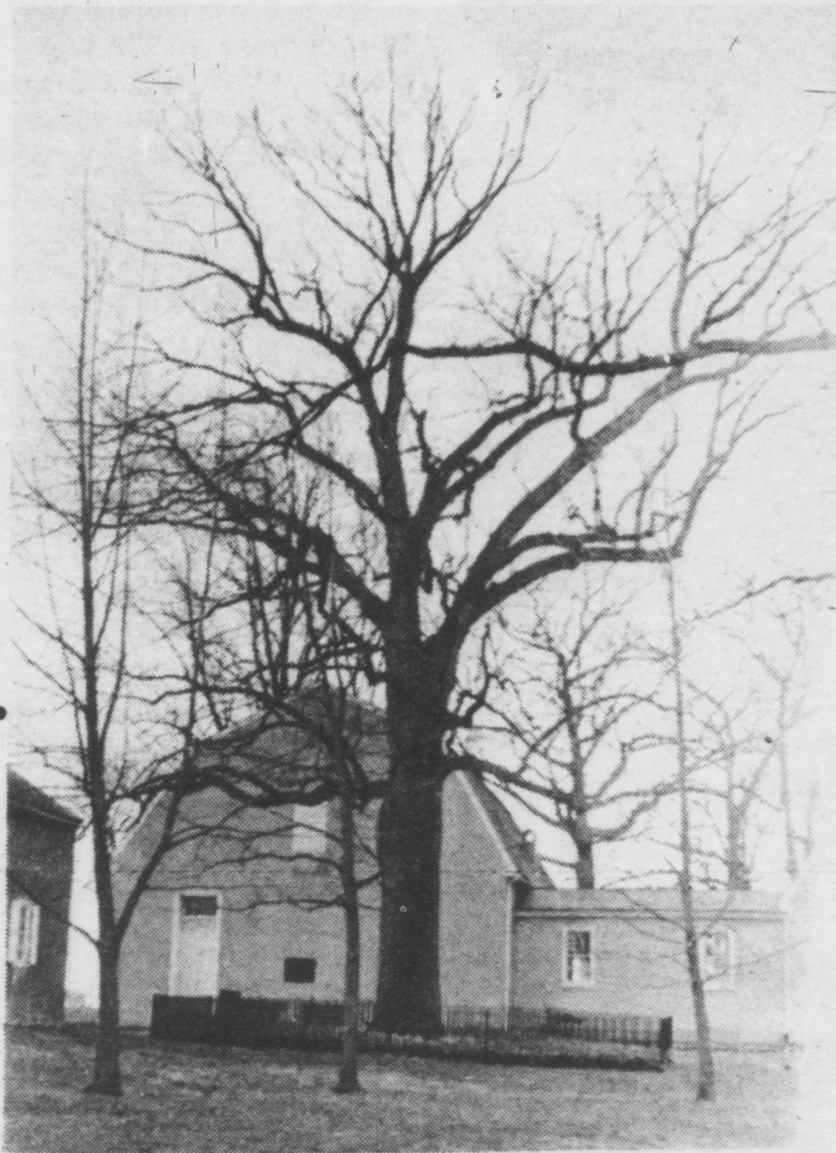
THE WITNESS TREE

Events in Lexington and Concord, Massachusetts, in April, 1775, foreshadowed a solemn oath that would be taken in June, 1777, around a tree outside Donegal Presbyterian Church.