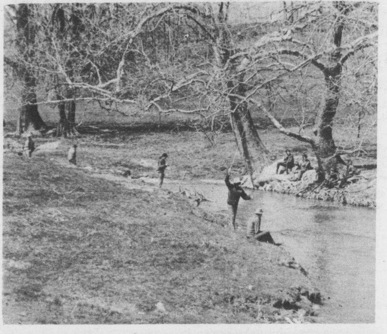
First day of trout season on Donegal Creek