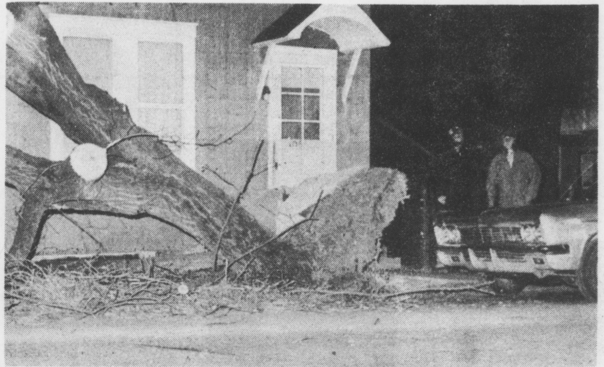
MAYTOWN SIDEWALK TORN UP WHEN TREE TOPPLED IN STORM

STATE FARM MUTUAL AUTOMOBILE INSURANCE COMPANY Home Office: Bloomington, Illinois