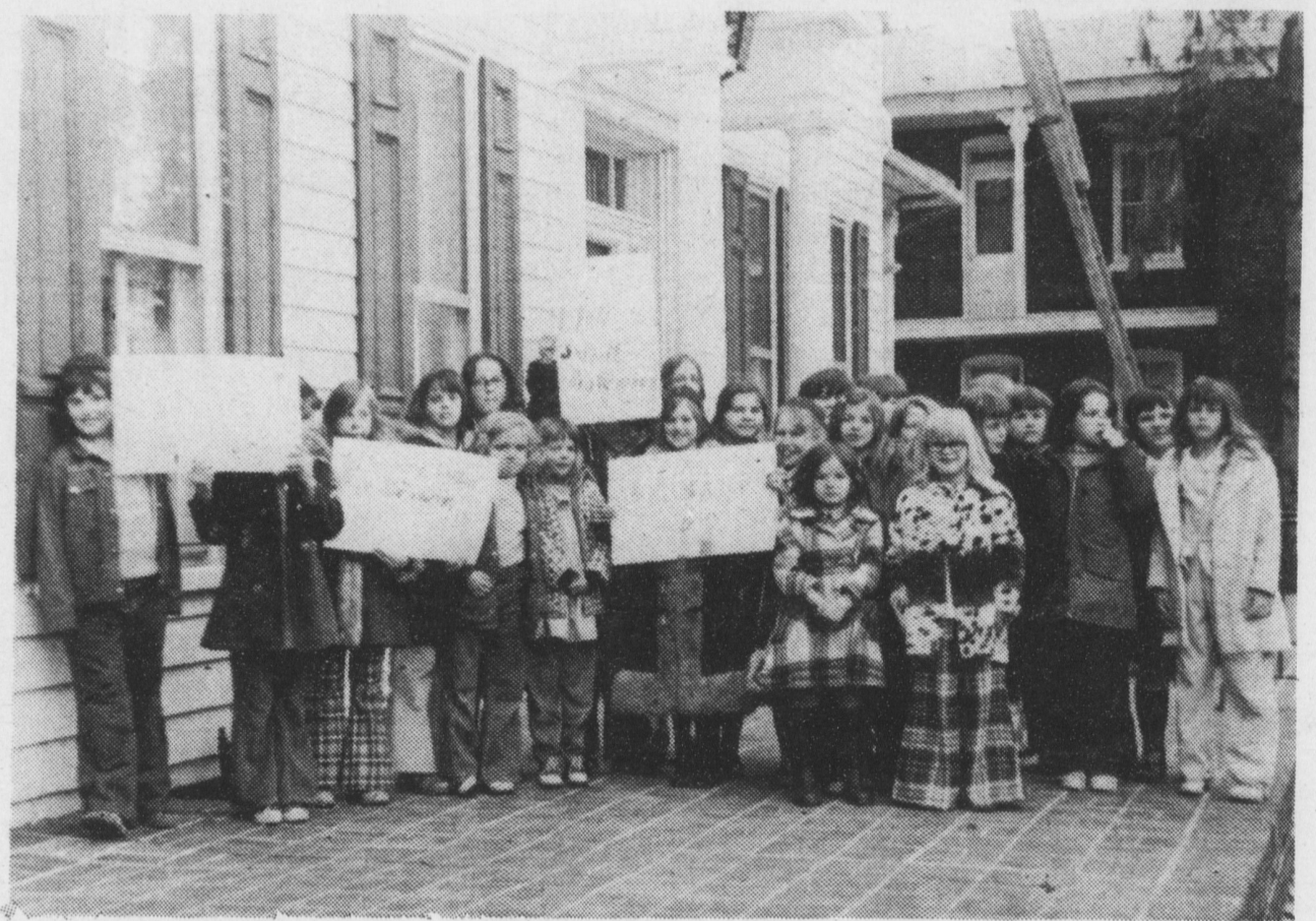
Juniors and Brownies last week at Marietta Community House after a parade down Market Street, in which they carried placards, asking for adult leaders.