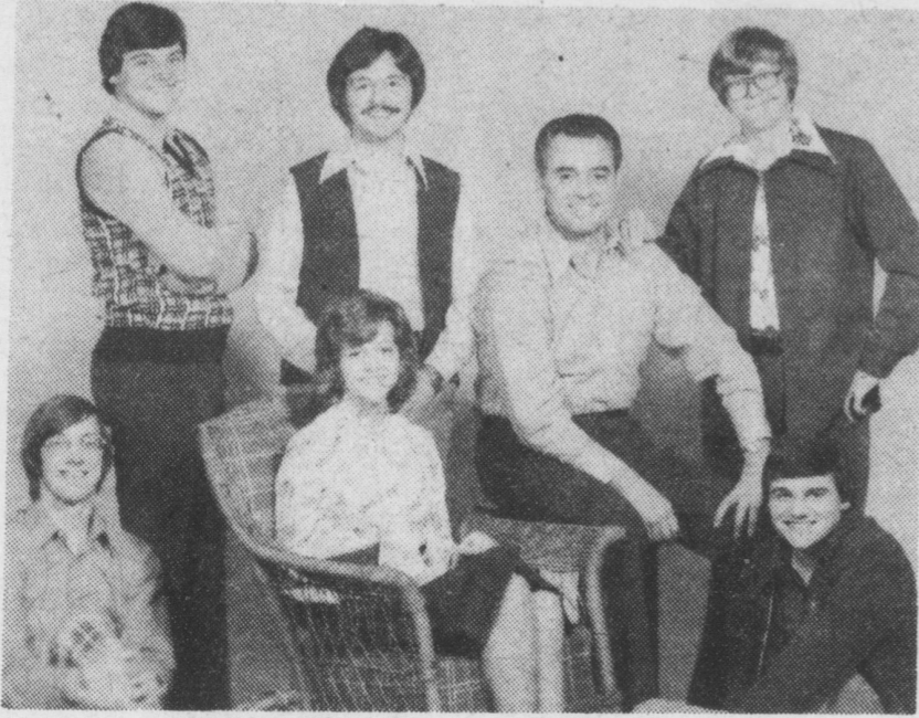
"The Churchmen and Teresa"