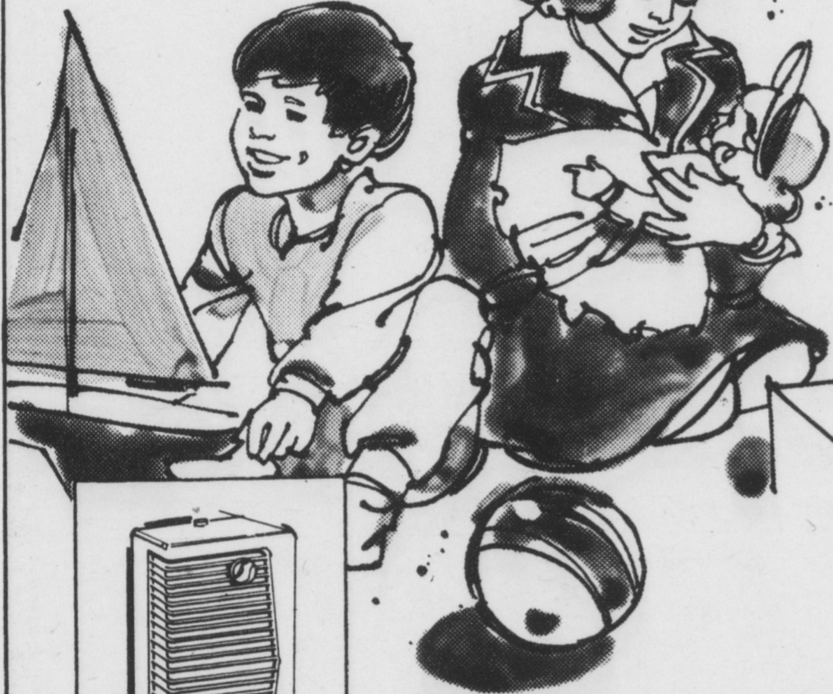
The neat, compact Tel-Butler fits discreetly by your door.

When the bell rings, answer by phone first. There's no need to open the door. Just pick up the nearest phone and talk with the caller by Tel-Butler. Call our business office for installation information.