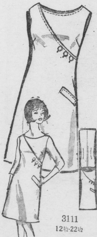
3111 12 1/2-22 1/2 Chic Smooth Pillar

You might consider covering the freezer with blankets, quilts, or some other covering. It will also help to put crumpled newspaper or excelsior between the cabinet and the blankets. But do not allow the coverings on the freezer to cover the air-vent opening. The power may go on unexpectedly and the unit will