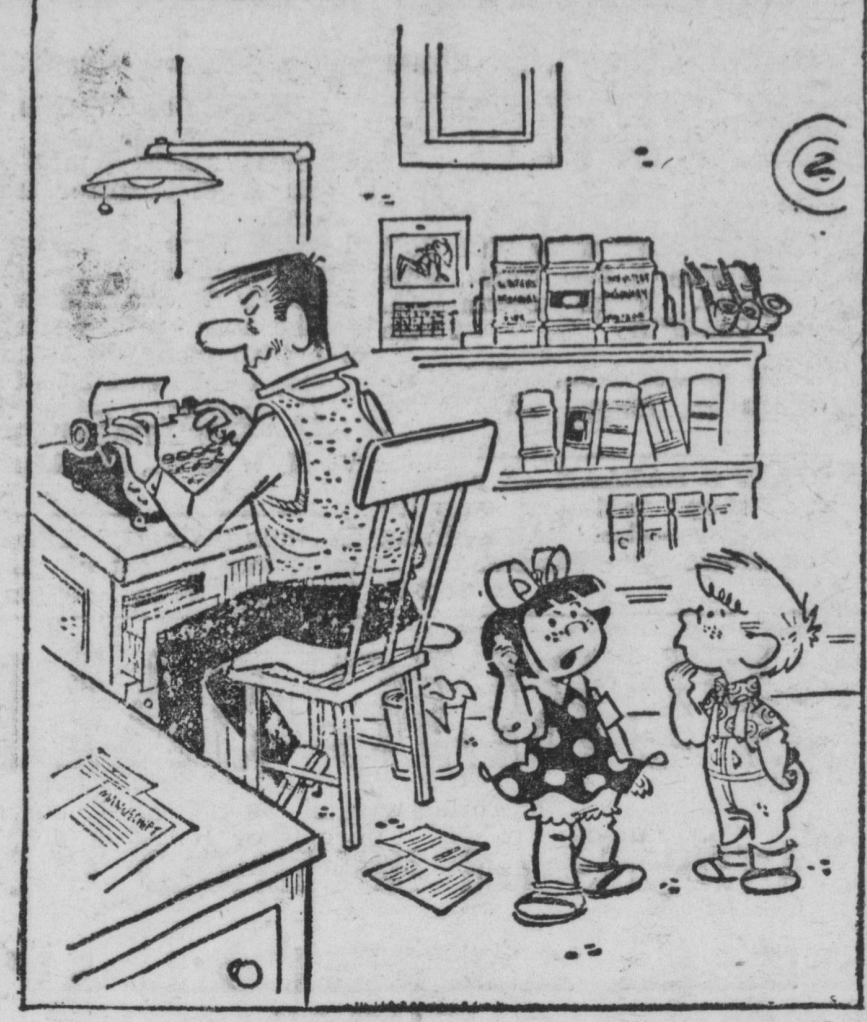
"Pop's writing a book-how to raise a daughter and bear it!"