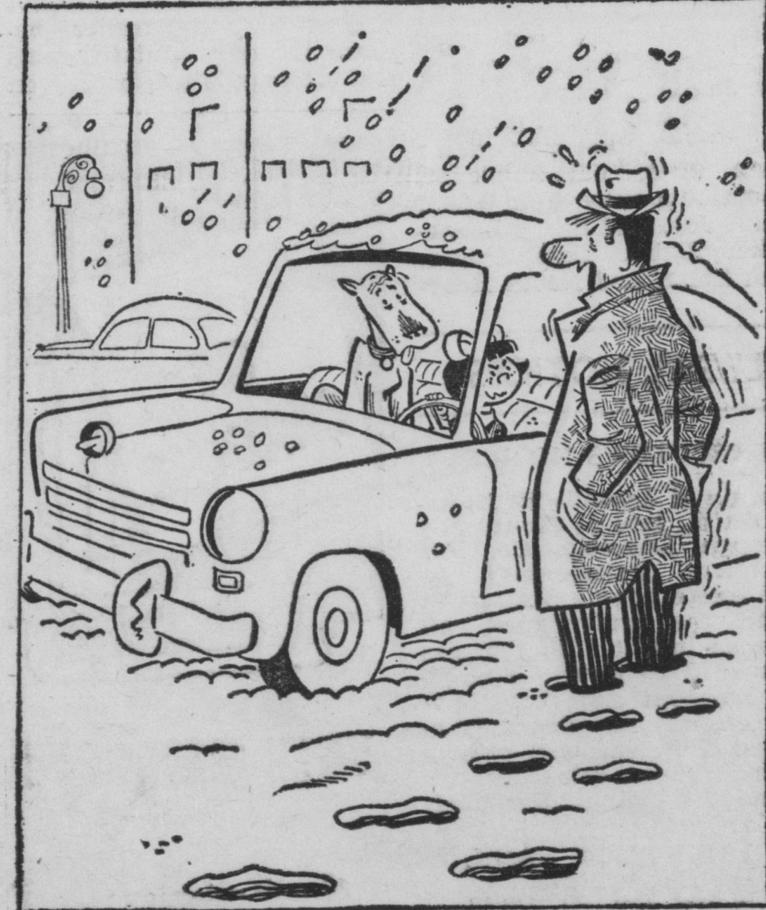
"All right, all right! I'll buy the dog a valentine-now please open the door!"