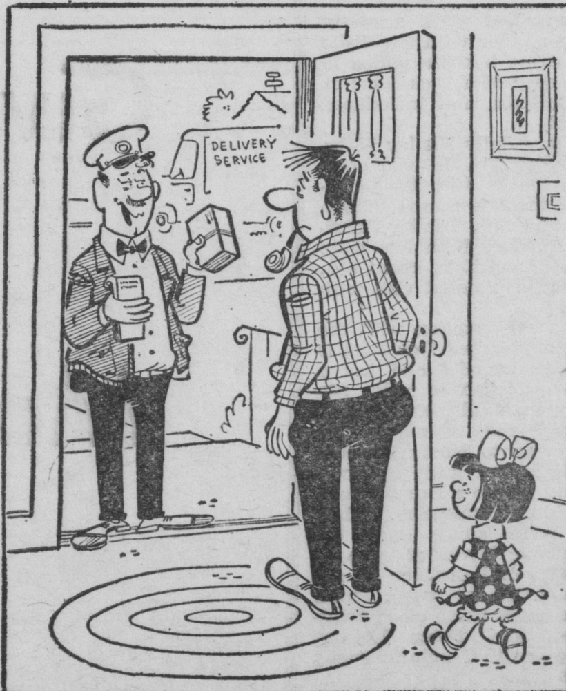
"Are you the 'Sweetie Pie Simpson' who ordered the business cards?"