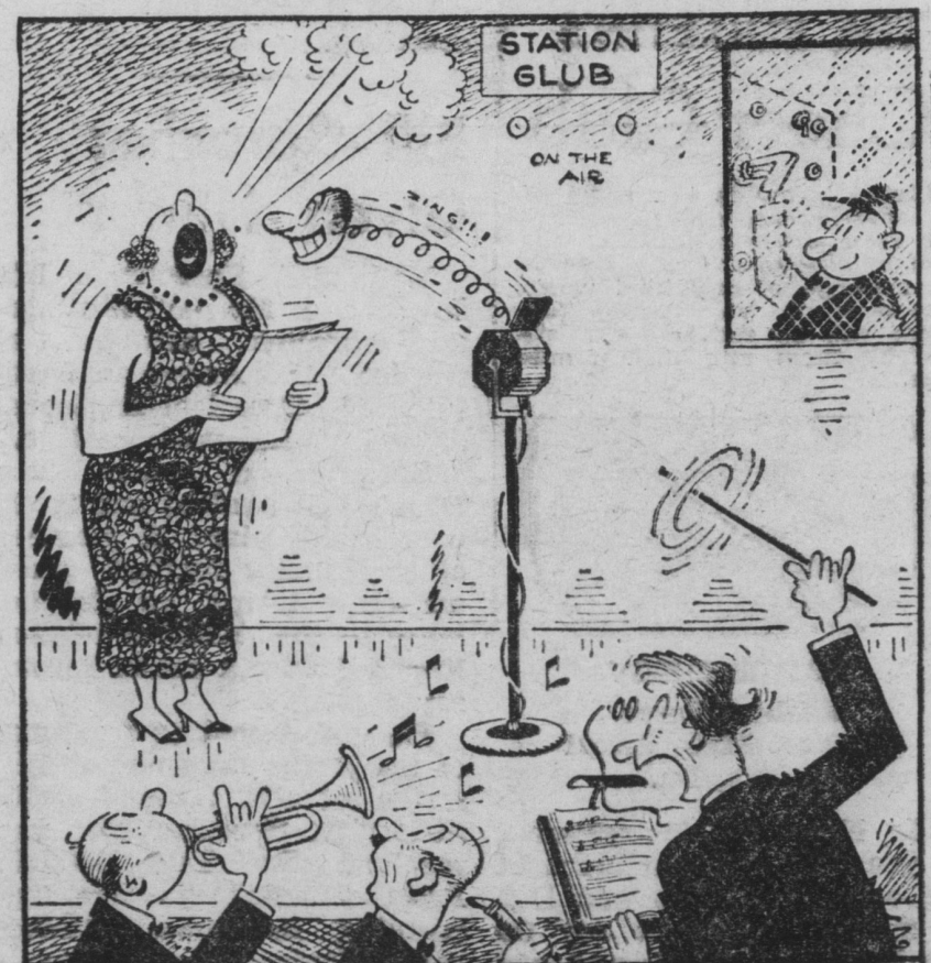
"It's a trick to scare her into hitting high C!"