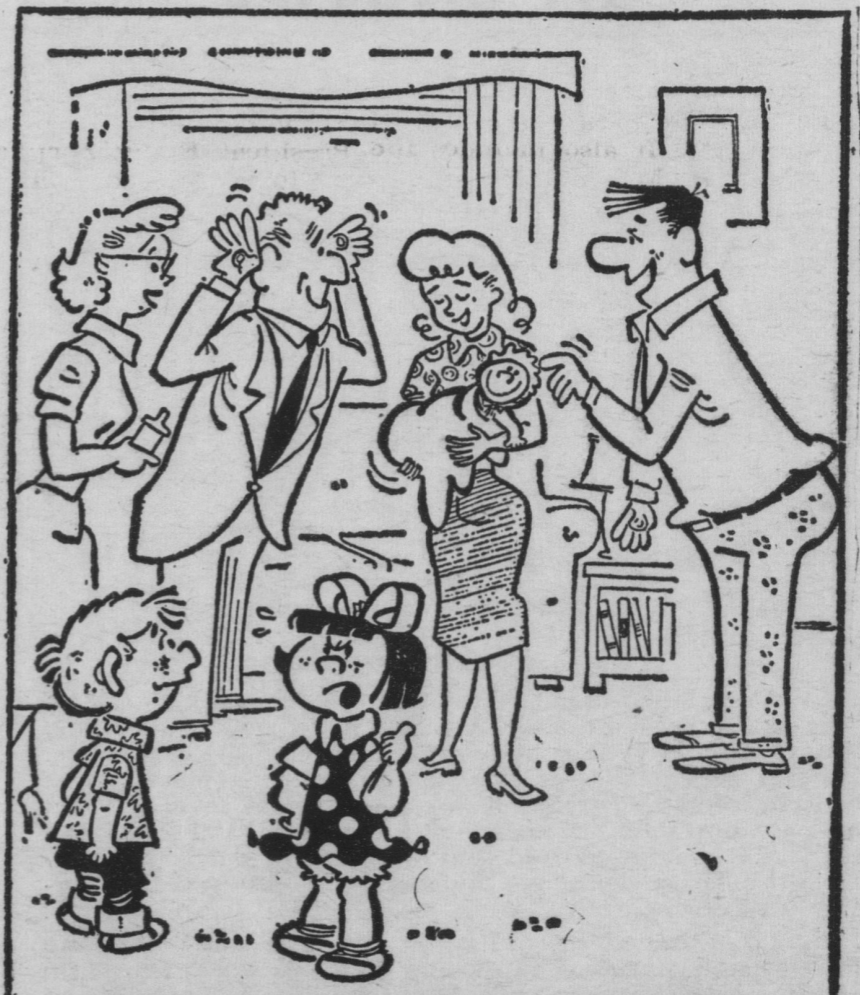
"Every time there's a baby around, everybody forgets how to speak English!"