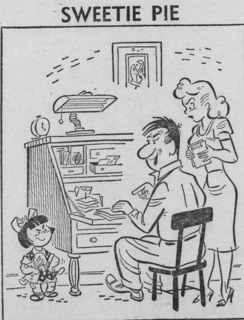
"At least there's one thing to be said for her—she's deductible!"