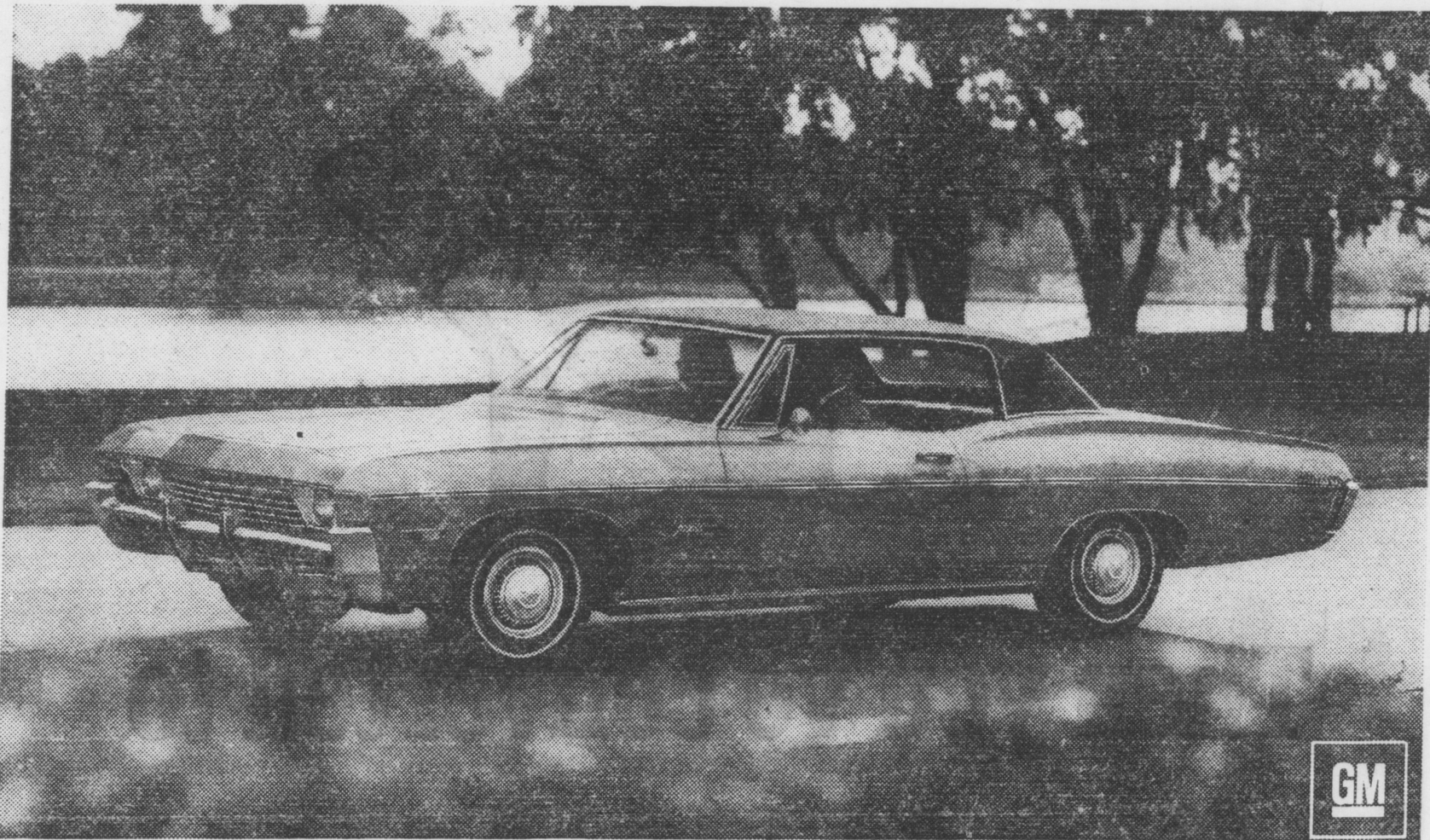
Impala Custom Coupe