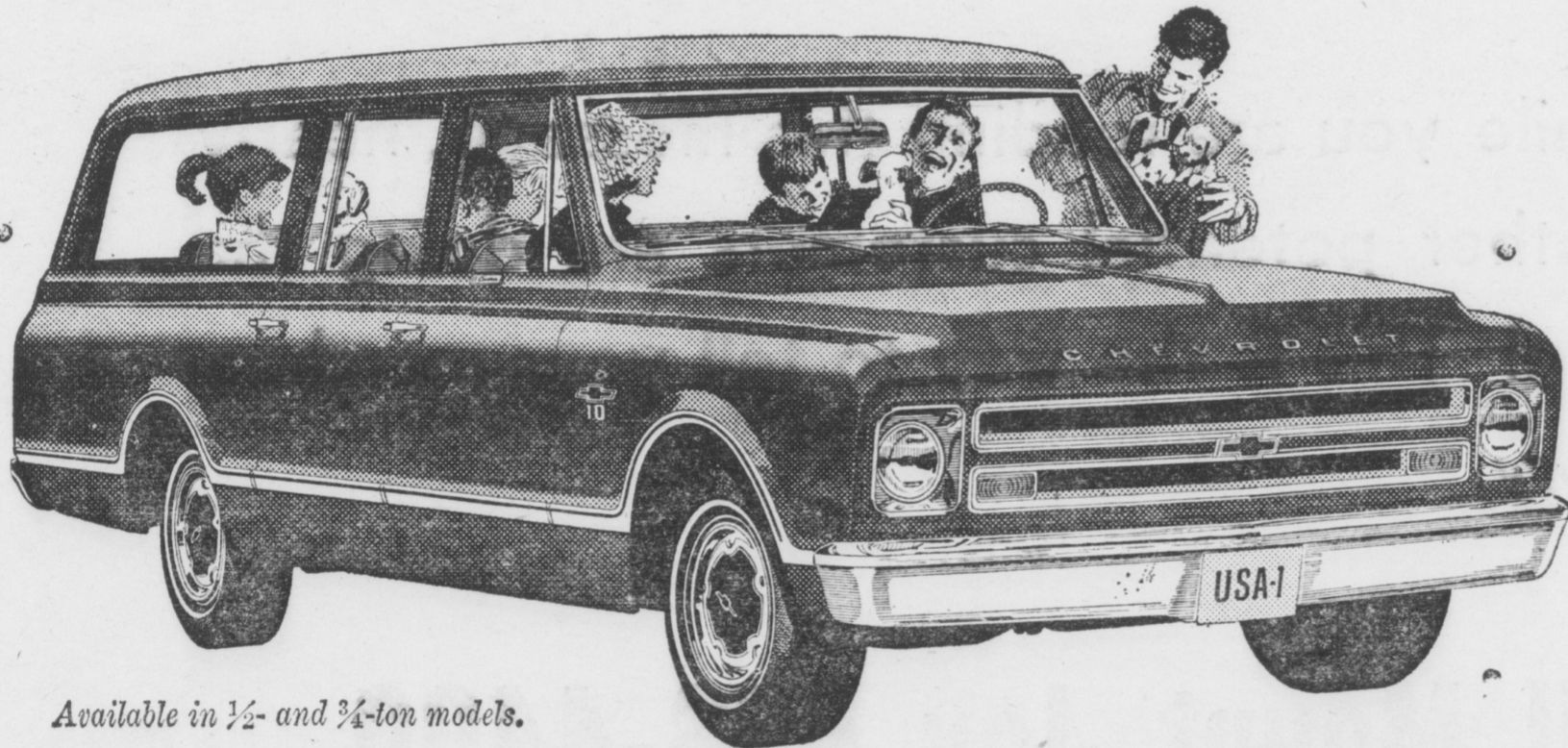
Available in 1/2- and 3/4-ton models.

The look, the ride of a station wagon, plus a tough truck chassis!