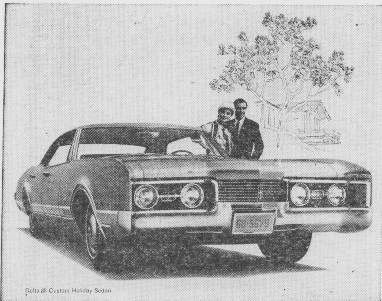
Delta 88 Custom Holiday Sedan

SEE YOUR NEARBY OLDS DEALER FOR: TORONADO • NINETY-EIGHT • DELTA 88 • DELMONT 88 • CUTLASS SUPREME • F-85 • VISTA CRUISER • 4-4-2