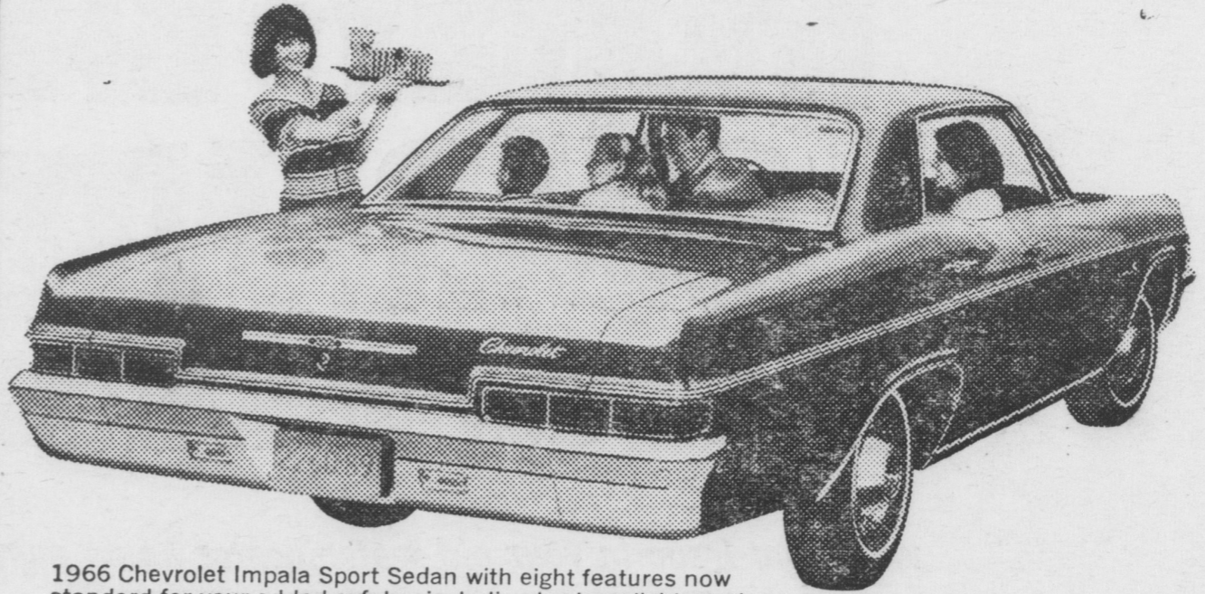
1966 Chevrolet Impala Sport Sedan with eight features now standard for your added safety—including back-up lights and seat belts front and rear (always buckle up!).

What you get is • The meticulous coachwork of Body by Fisher that surrounds you with rich appointments, deep-twist carpeting • Full Coil suspension that uncrinkles roads • Magic-Mirror finish • Gobs of room for hips, legs and feet.