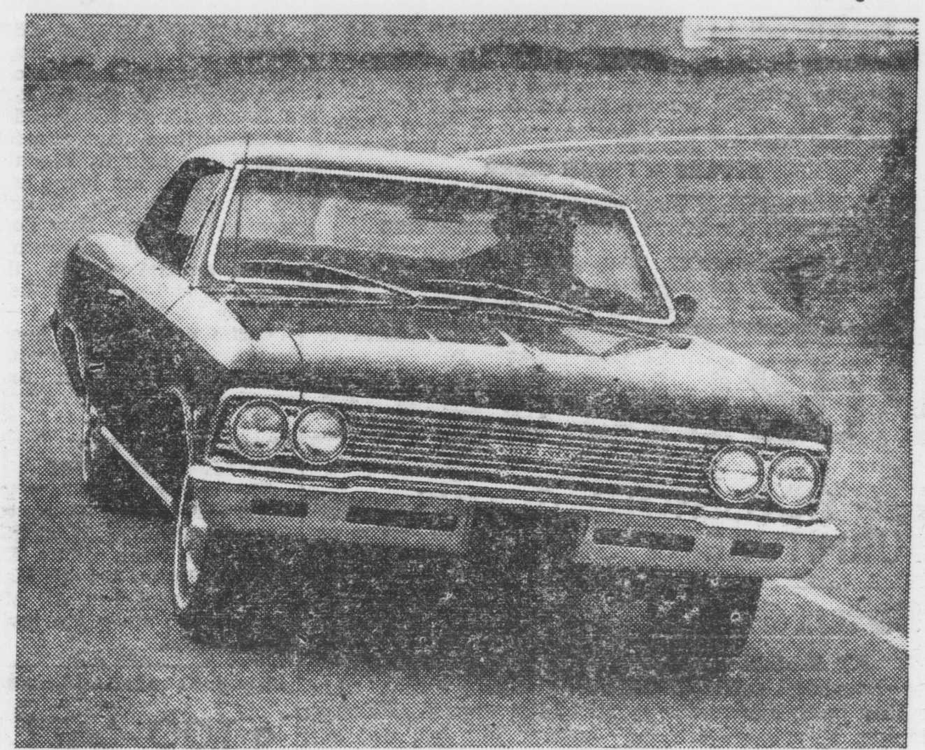
Chevelle Malibu Sport Coupe—with eight new standard safety features, including outside rearview mirror and shatter-resistant inside mirror. Always check both mirrors before pulling out to pass.

The way people are snapping up buys on new Chevelle V8's at your Chevrolet dealer's ... you'd think they're really getting away with something.