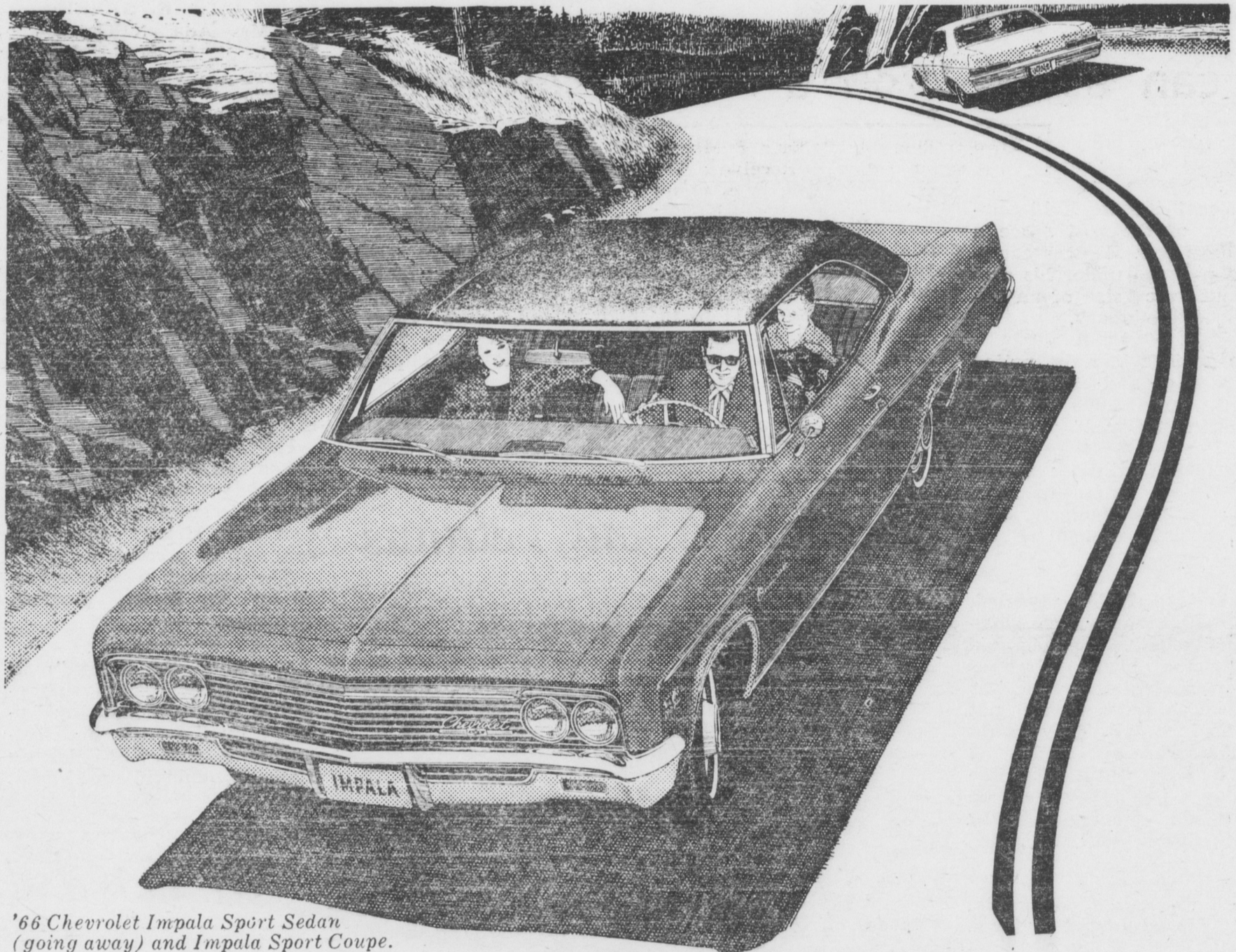
'66 Chevrolet Impala Sport Sedan (going away) and Impala Sport Coupe.

COLUMBIA - UNITED TELEPHONE CO. TELEPHONE 684-2101