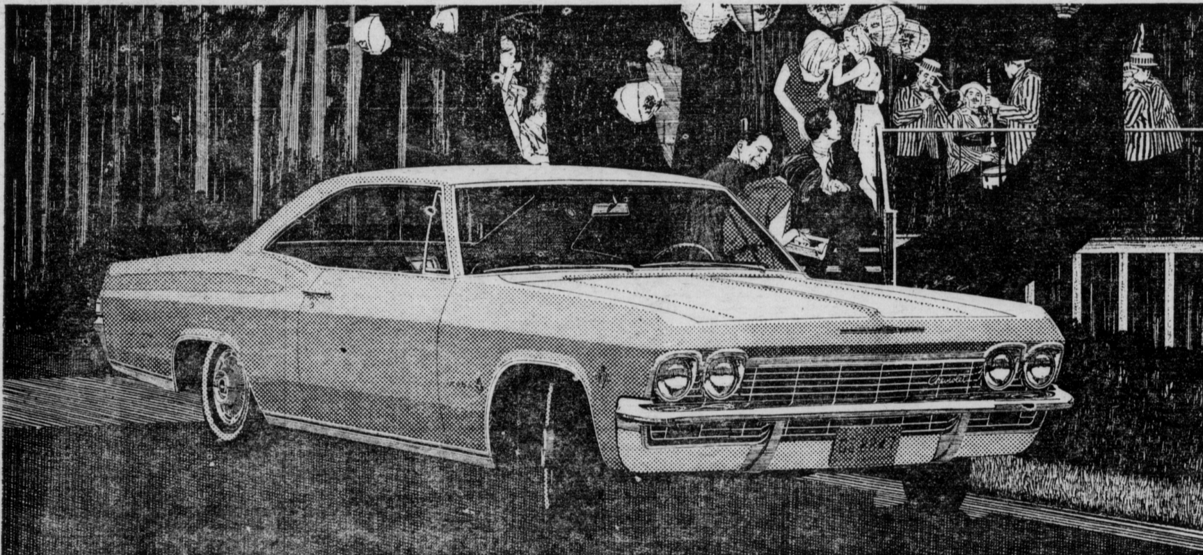
Sporty Swinger! '65 Chevrolet Impala Sport Coupe

Luxurious new look Luxurious new room Luxurious new ride (discover the difference)