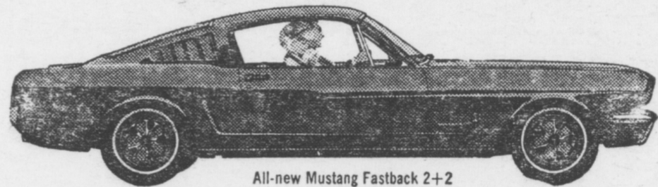
All-new Mustang Fastback 2+2