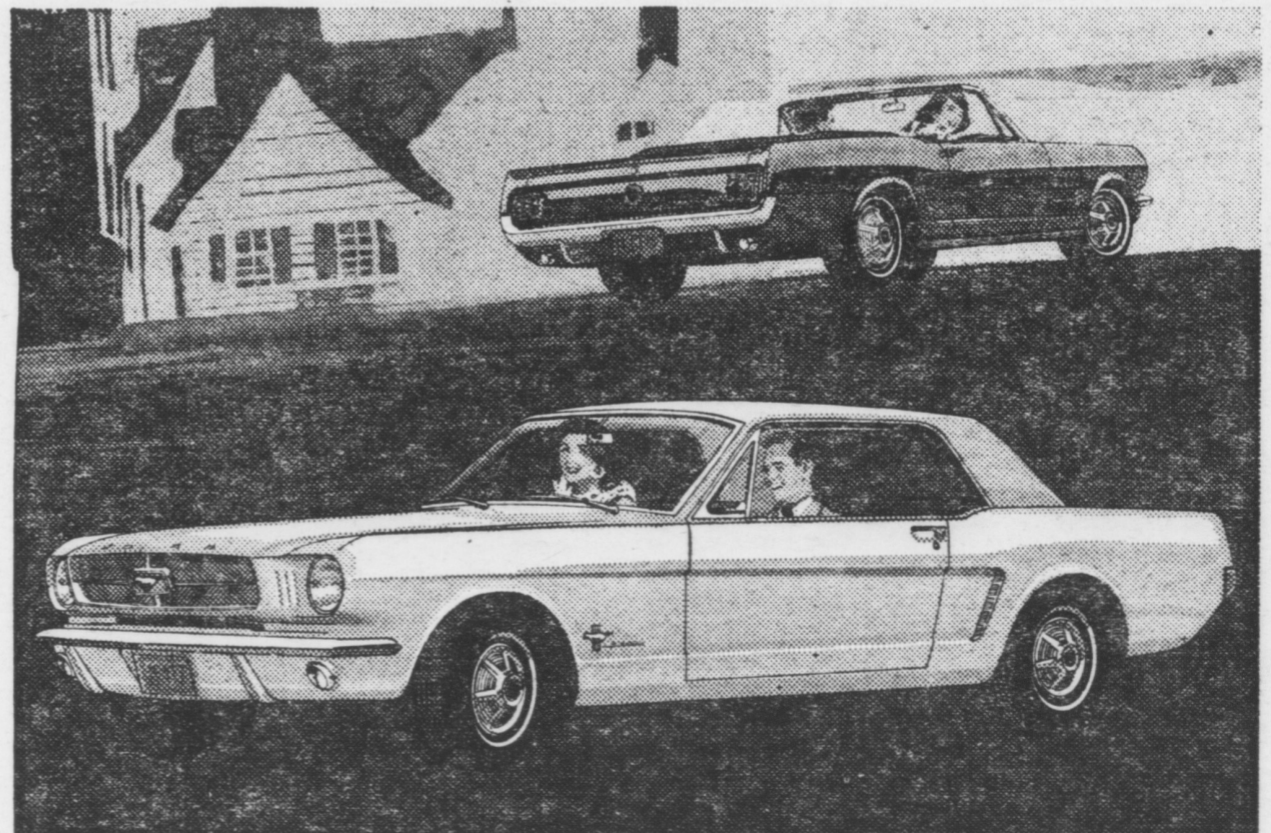
Foreground: Mustang Hardtop. Background: Mustang Convertible.

Now...we Ford Dealers have three '65 Mustangs