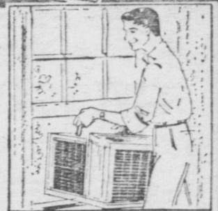
Put it in the window and plug it in.

• Specially designed for bedroom use—it's whisper quiet • Installs in minutes—just set it in the window and plug it in • Carry handles for easy portability • Automatic thermostat. Doubles as a dehumidifier—squeezes up to 6 gallons of moisture a day from the air.