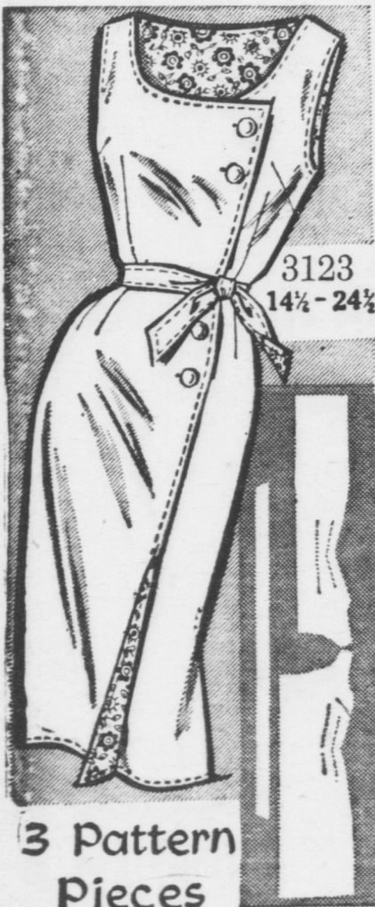
3 Pattern Pieces

The first man to fly an airplane over both the North and South Poles was Admiral Richard E. Byrd.