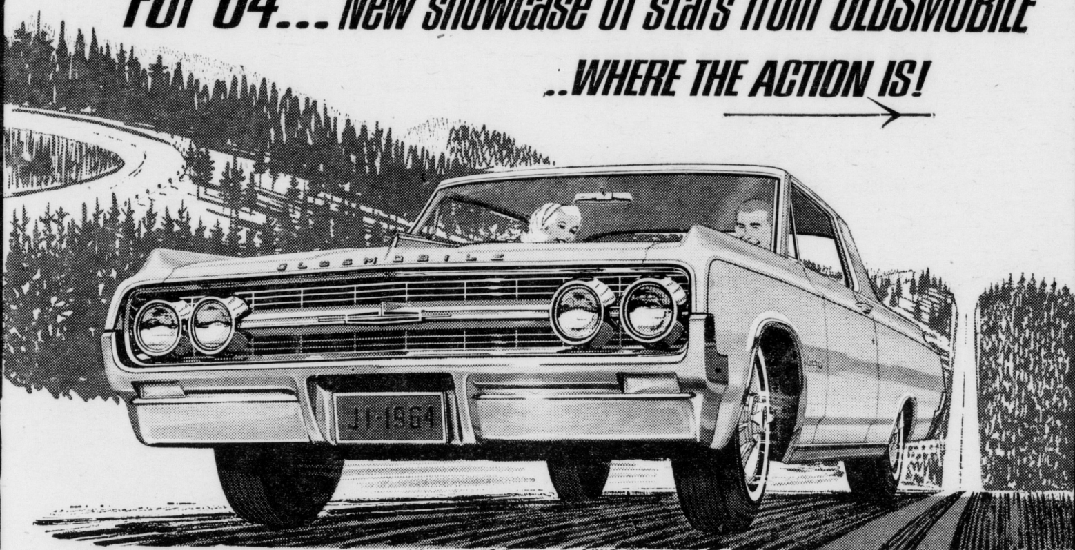
TWO NEW NEVER BEFORE OLDSMOBILES!