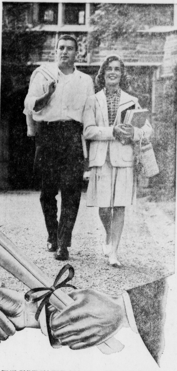
THE CHURCH FOR ALL • ALL FOR THE CHURCH

Through the Church you can, as a pioneer, strive most effectively toward generous, tolerant tomorrows for your fellowmen.