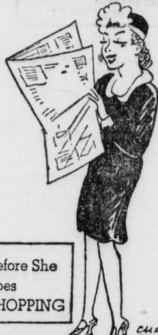
before she goes SHOPPING