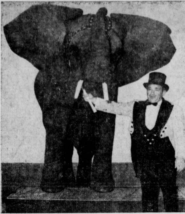
Famous Ringling trainer Hugo Schmitt shows off Diamond, only performing African male elephant. Note Diamond's tremendous ears, a principal difference between Africans and the more common Indian varieties. Diamond will be seen in the Greatest Show on Earth at Hershey Sports Arena, May 27, 28 and 30.

Chills will be provided by world-renowned aerialists, show Sunday.