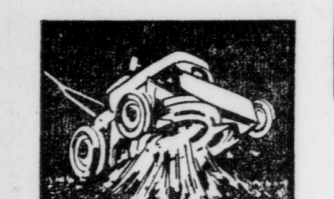
Turbocone suction sets up grass or creeping weed stems for smooth, clean, even cutting.

Jacobsen Turbocone is a newly developed engineering principle of a cutting unit which provides a cleaner, smoother and safer cut.