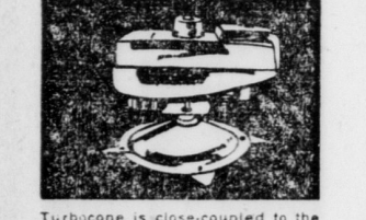
Turbocone is close-coupled to the engine for great strength. One-Year Warranty against crankshaft bending.

9 Models Available Choose the Jacobsen Mower Best for You at