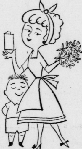
Send your best to "mother" ... send