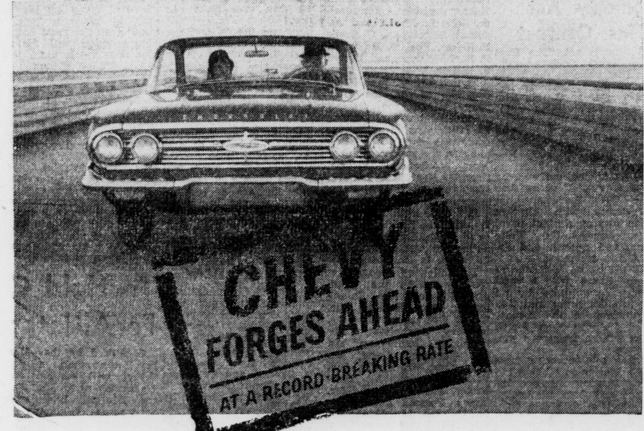
Impala Sport Coupe—one of Chevy's 18 fresh-minted models for '60. See The Dinah Shore Chevy Show in color Sundays, NBC-TV... the Pat Boone Chevy Showroom weekly, ABC-TV

Factories are turning out more new Chevrolets every day. More proud new Chevy owners taking to the road. Now's the time to see your dealer for fast delivery and a favorable deal!