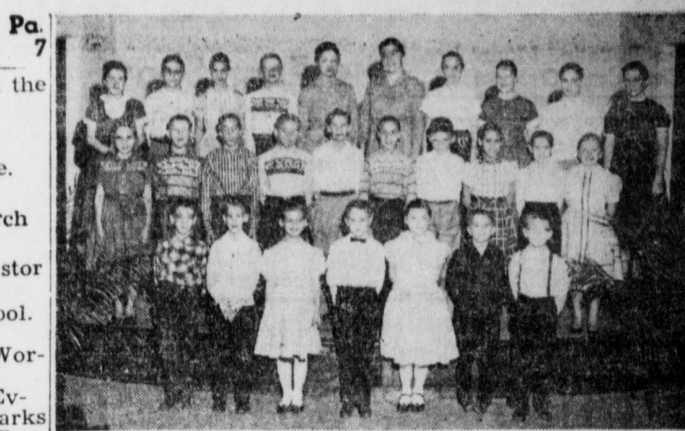
The Youth Choir members, a junior chorus of the Cross Roads Brethren in Christ church, Mount Joy, Pa. will appear in a program of narration and song, entitled, "A Melody In The Heart," to be given on Sunday evening, October 19, beginning at 7 o'clock.