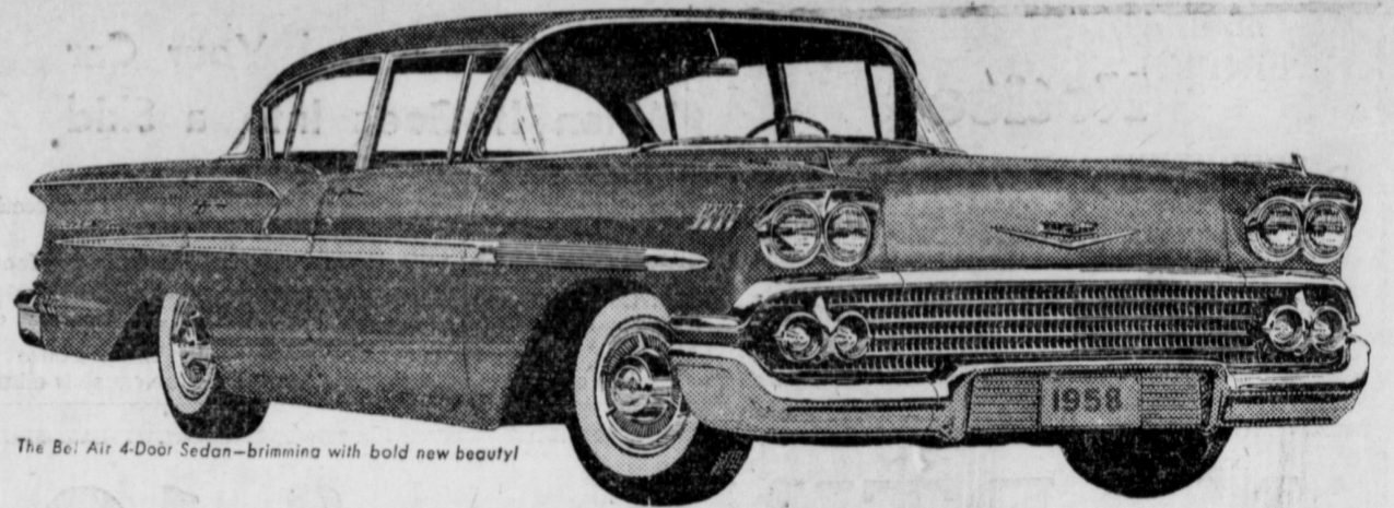
The Bel Air 4-Door Sedan—brimming with bold new beauty!