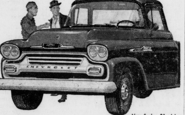
New Series 31 pickup

Newest editions of the "Big Wheel" in trucks with NEW HUSTLE! NEW MUSCLE! NEW STYLE!