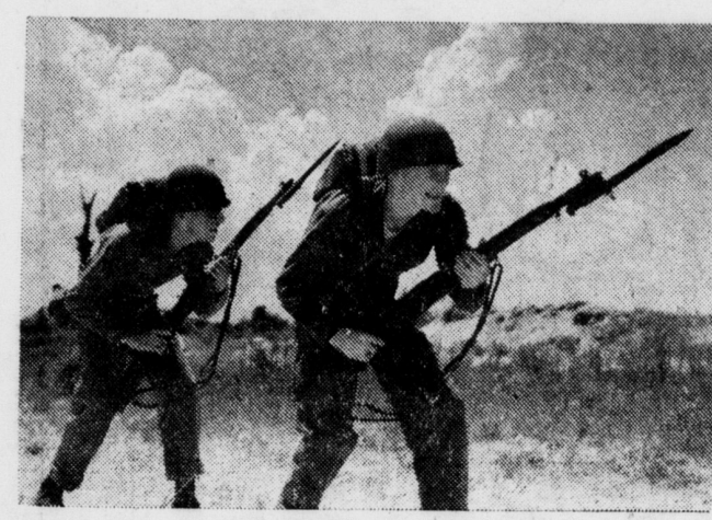
Members of the First Ordnance Field Maintenance Company of the United States Marine Corps Reserve, Columbia, Pa., advance on the "agressor" in full battle garb.

National Rifle Association On Sunday there will be a The Sports Farm which is specifications and will be a-sharp-shooting demonstration nearing completion, will fea-mong the finest ranges in the by the Lancaster Junior Rifle ture many modern facilities state.