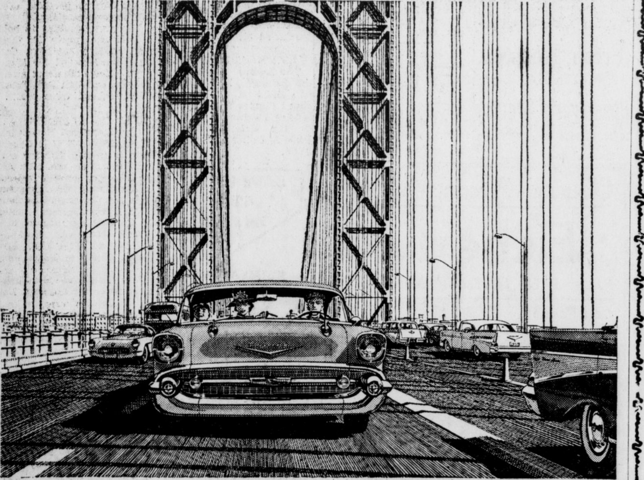
Better try it soon—Chevrolet Bel Air Sport Sedan!

GET A WINNING DEAL ON A NEW CHEVY—THE GETTING'S EXTRA GOOD!