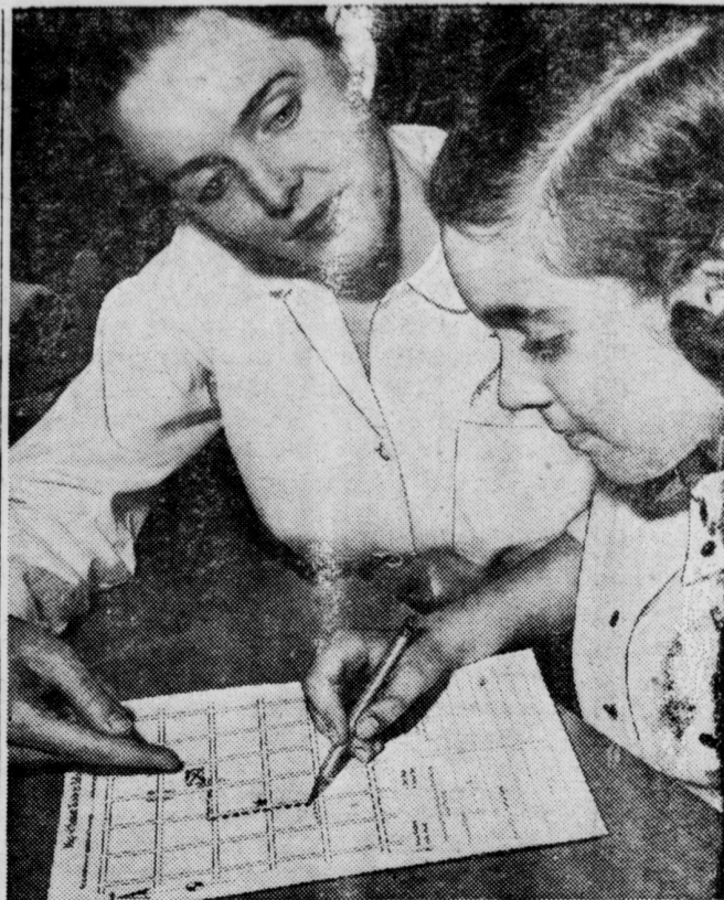
MAPPING SAFEST ROUTE TO SCHOOL is one of the most constructive projects now awaiting grade schoolers on their return to classes. Maps worked over under the guidance of teachers, as shown above, on the basis of a program developed by the American Automobile Association, are for showing to parents who then lend a hand in charting the safest course for their children.