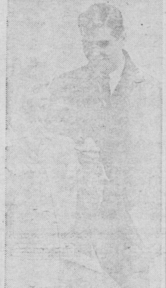
TEEN AGE TWOSOME follows today's smart trend in leather outerwear. He wears the popular new leather carcoat with collar and sleeves of bulky wool; she a hip-length jacket in soft grained leather.

Going from counter to counter and from rack to rack, Mom will probably have more fun than junior - at least until he gets a chance to wear his new duds.