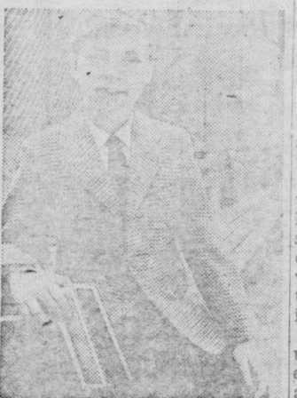
BIG BROTHER STYLING is reflected in this small check wool sport coat. The over-all impression is a quiet one, in line with today's trend in boys' clothing. By Sambeck.