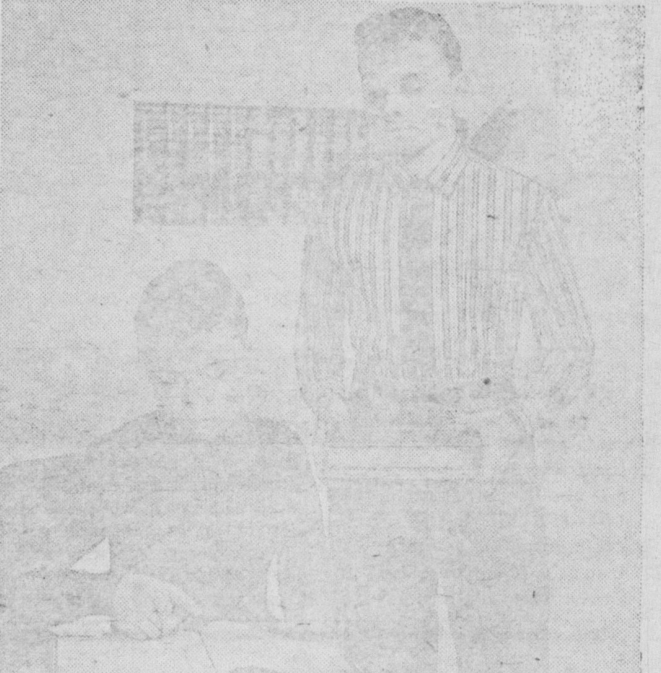
BACK TO BOOKS AND GLASSES go these young students, looking neat and trim in their new sport shirts. At left, a subtly striped knit model that can be worn either inside or outside slacks; at right, a striped Ivy League shirt, made with button-down collar. By Kaynee.

One possible reason for this state of mind is that for years, boys' clothes were drab and showed very little variety, color or style. Today, however, the picture is quite different, and mother can get just as much enjoyment out of shopping for a back-to-school