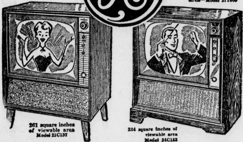
261 square inches of viewable area Model 21C137