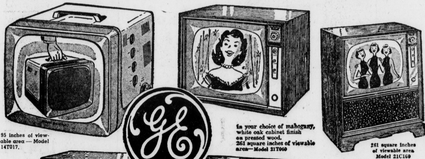
95 inches of viewable area — Model 14T017.