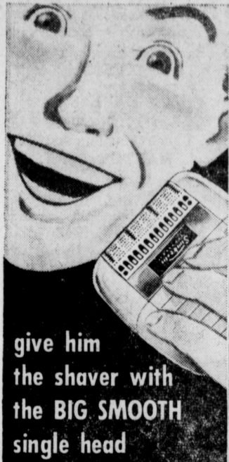
give him the shaver with the BIG SMOOTH single head

It is anticipated that the Saturday morning closings will not inconvenience customers in paying service bills. Bills may be paid at company offices at anytime after new hours, through the bill payment depository facilities now installed at all P. P. & L. commercial offices. Envelopes are available in containers located near each depository for enclosing customers' payments.