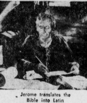
Jerome translates the Bible into Latin