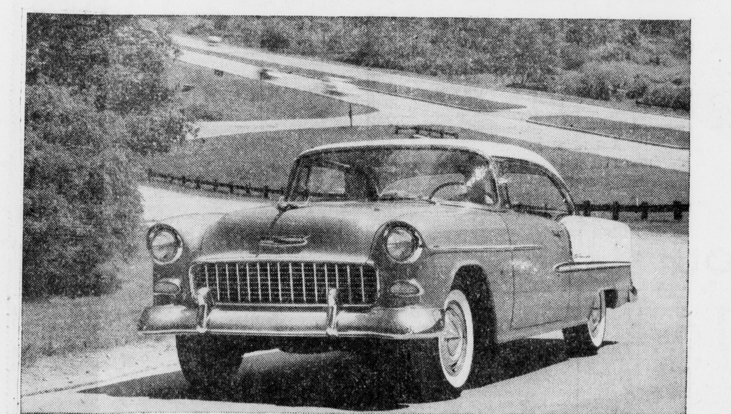
Great Features back up Chevrolet Performance: Body by Fisher - Ball-Race Steering - Outrigger Rear Springs - Anti-Dive Braking - 12-Volt Electrical System - Nine Engine-Drive Choices.

The new Chevrolet has proved itself all K-I-N-G in today's toughest driving competition!